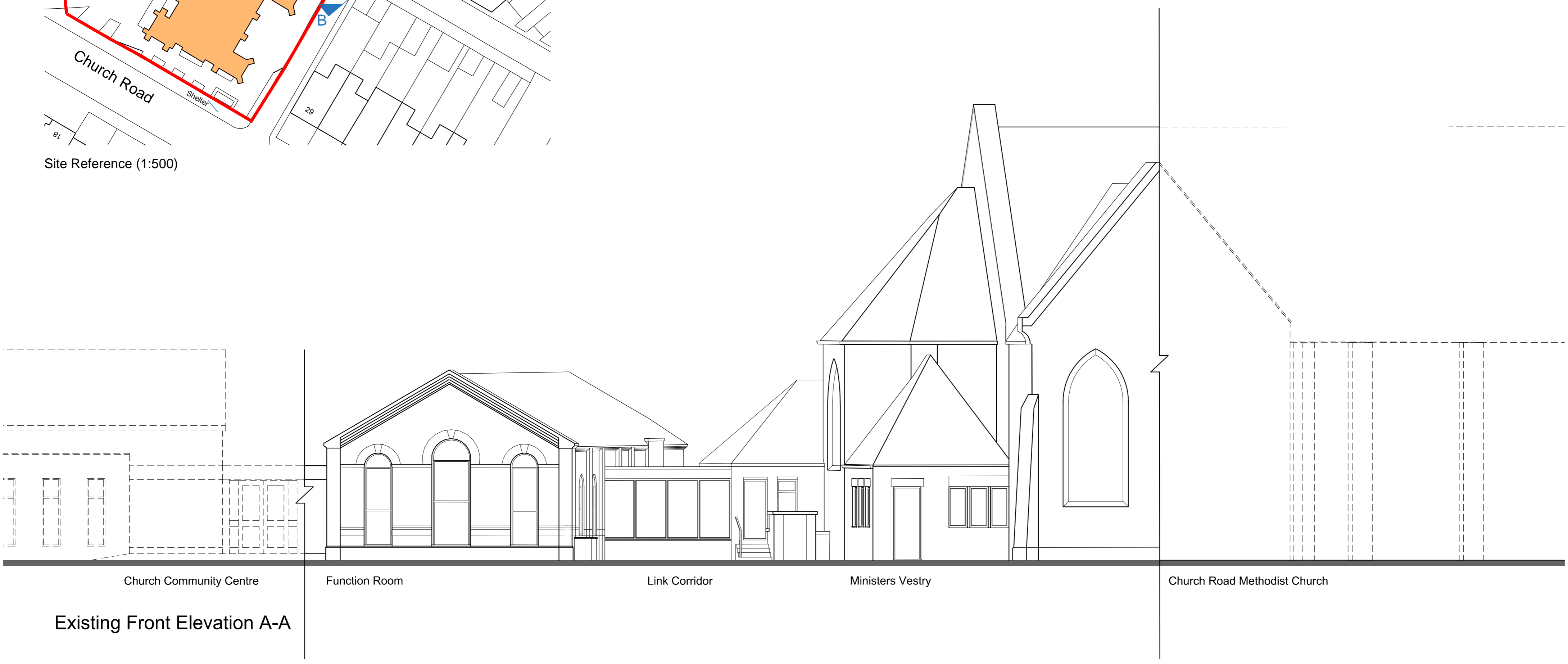
Existing Front Elevation A-A