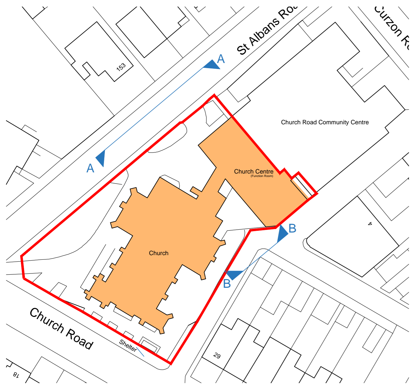
Site Reference (1:500)