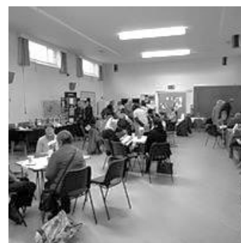
Church Road Methodist Open Day 14th January 2018

On Sunday 14 January, we enjoyed an afternoon of nostalgia, remembering all the varied events and activities that had taken place in the Church Centre – Sunday School Pantomimes, Gilbert & Sullivan, amateur dramatics, as well as the many youth activities such as Rainbows, Brownies, Guides, Cabin Boys, and Boy's Brigade.